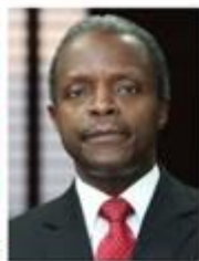
His Excellency, Professor Yemi Osinbajo, GCON Vice President, Federal Republic of Nigeria