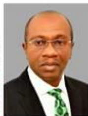
Mr. Godwin Emefiele, CON, FCIB Governor, Central Bank of Nigeria