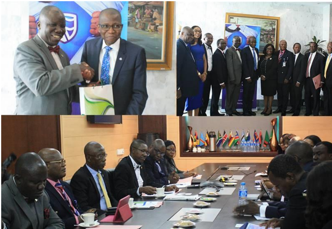
AT THE ACCREDITATION VISIT FOR STANBIC IBTC BLUE ACADEMY