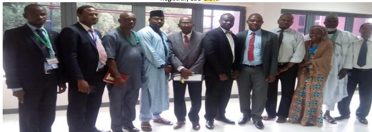
Group Photograph of Participants