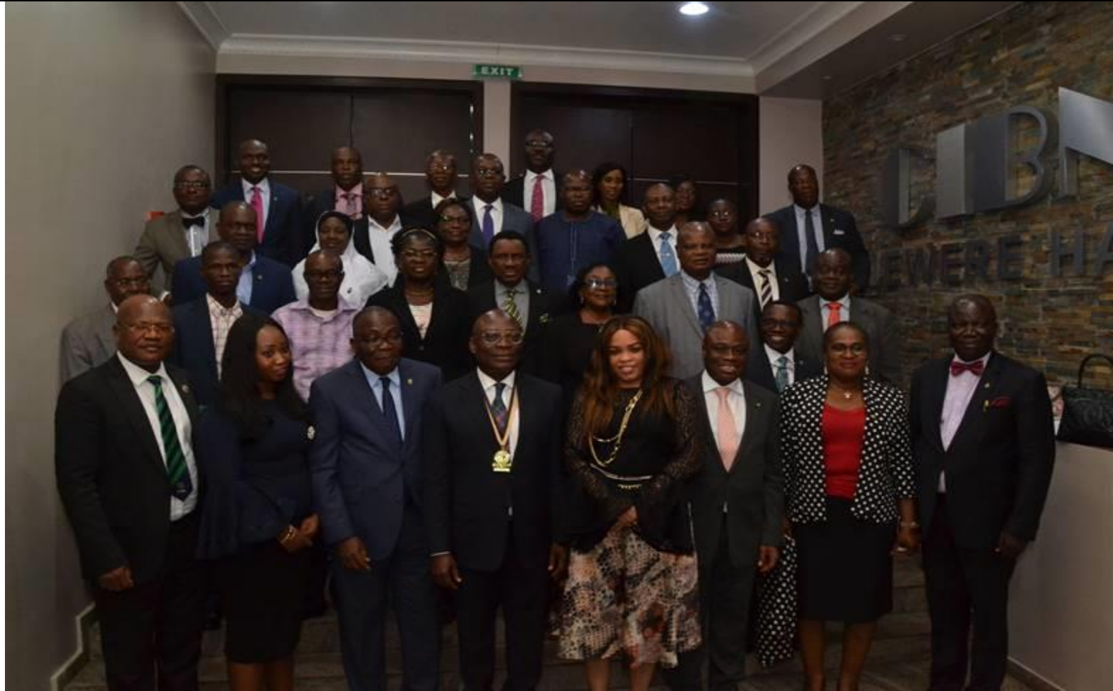
A Group Photograph taken after the signing of the Agreement