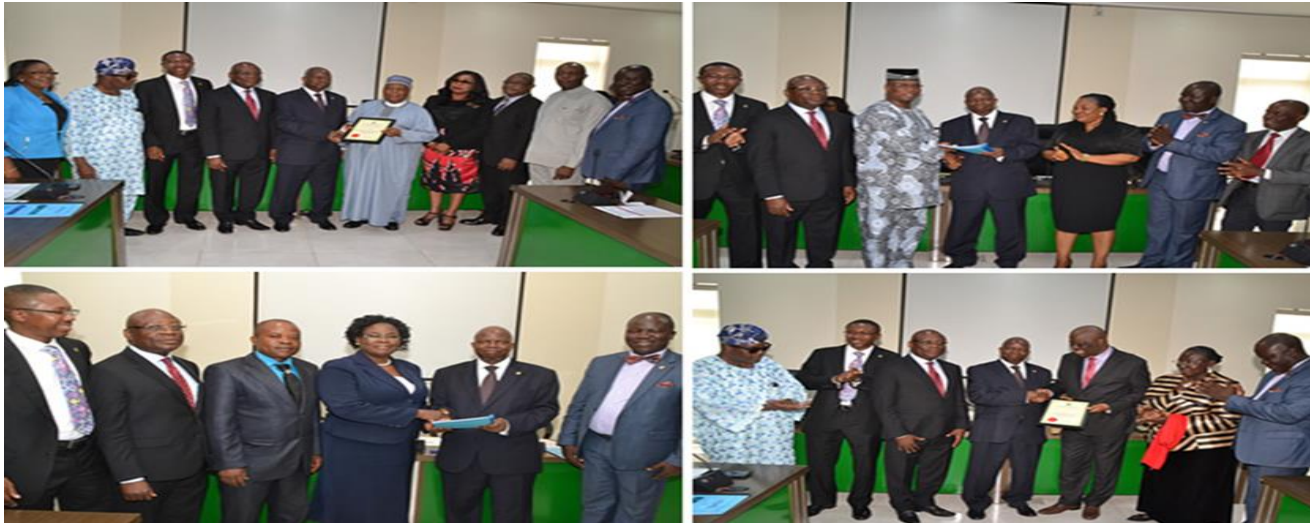
Pictures taken at the at the Execution of linkage agreement with Rivers state university of Science and Technology, Port Harcourt and Federal Polytechnic ado-Ekiti and the presentation of certificate of Accreditation to NDIC and Tom Associates Limited held at the Bankers House recently