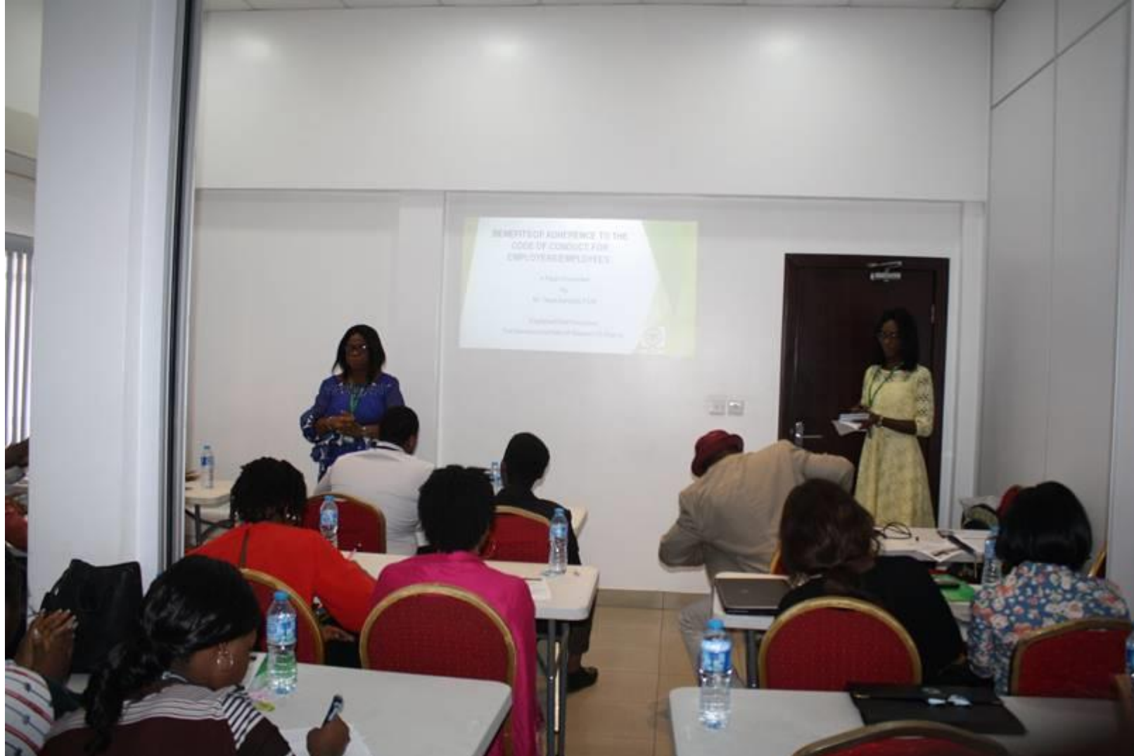
Cross- section of participants