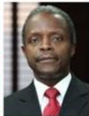
His Excellency, Professor Yemi Osinbajo, GCON Vice President, Federal Republic of Nigeria