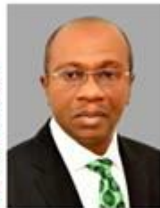
Mr. Godwin Emeziele, CON, FCIB Governor, Central Bank of Nigeria