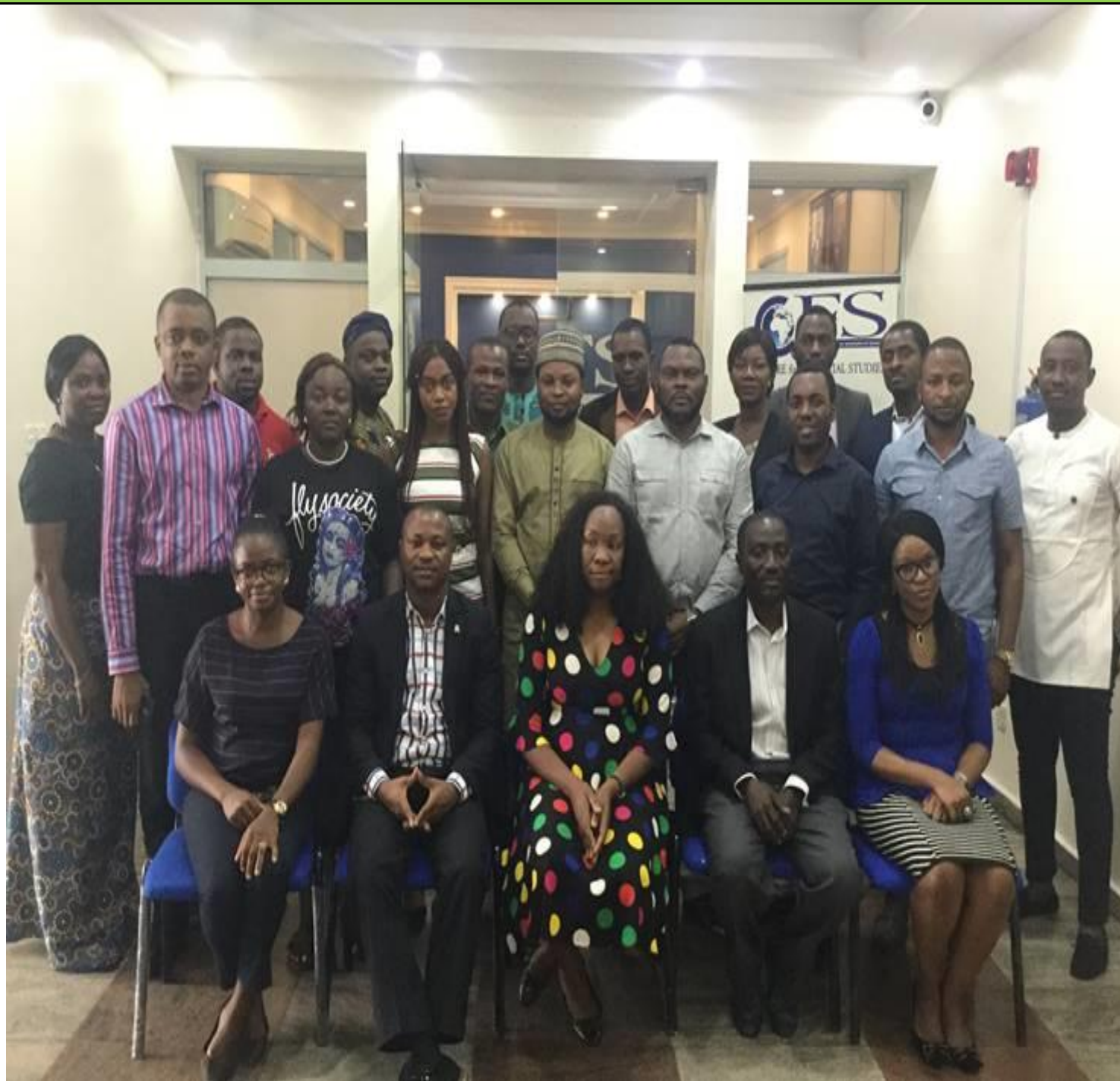
Group Photograph of Participants