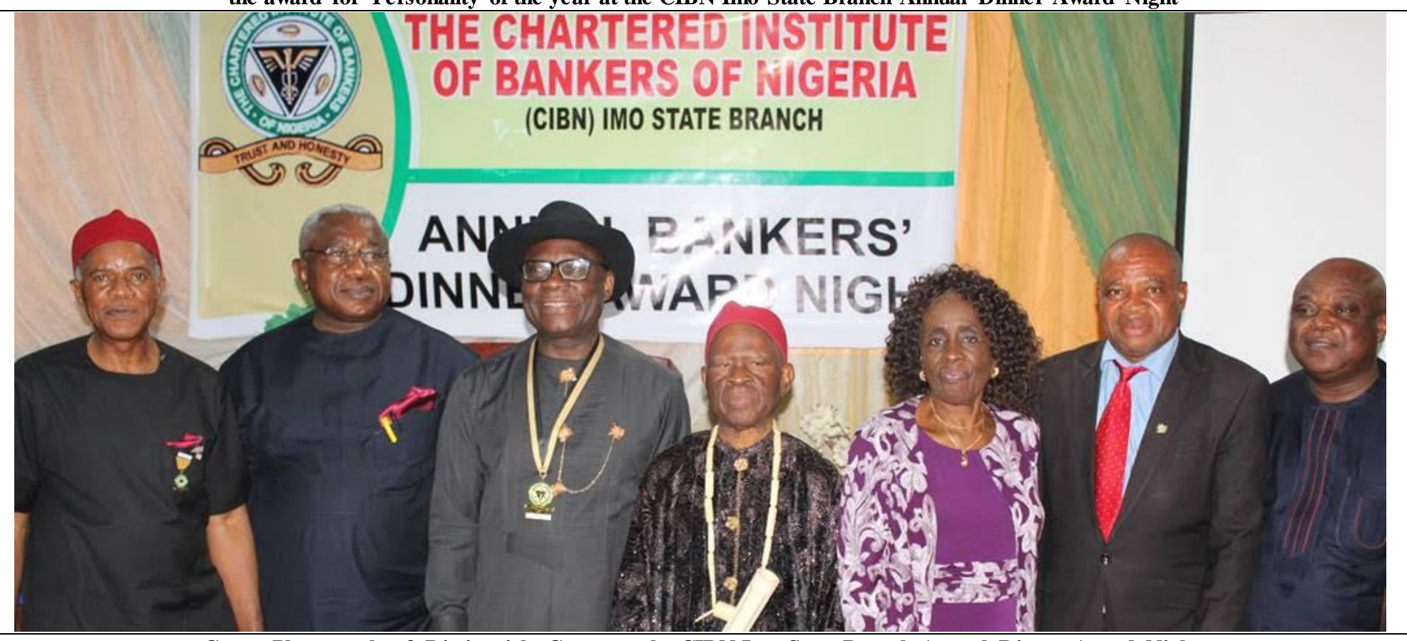
Group Photograph of Distinguish Guests at the CIBN Imo State Branch Annual Dinner Award Night