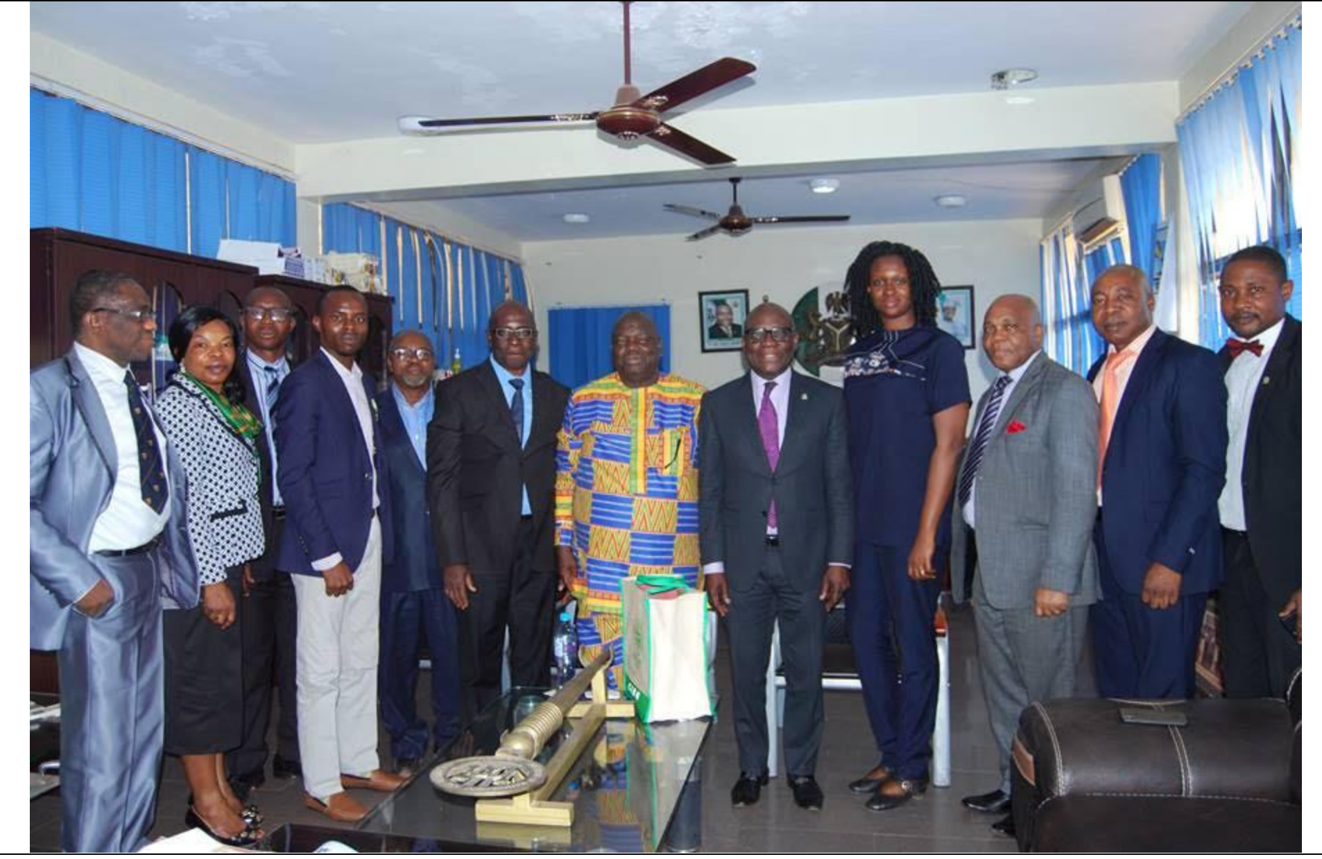
Group Photograph Taken during the Presidential Stakeholders engagement to the Institute of Management and Technology , Enugu