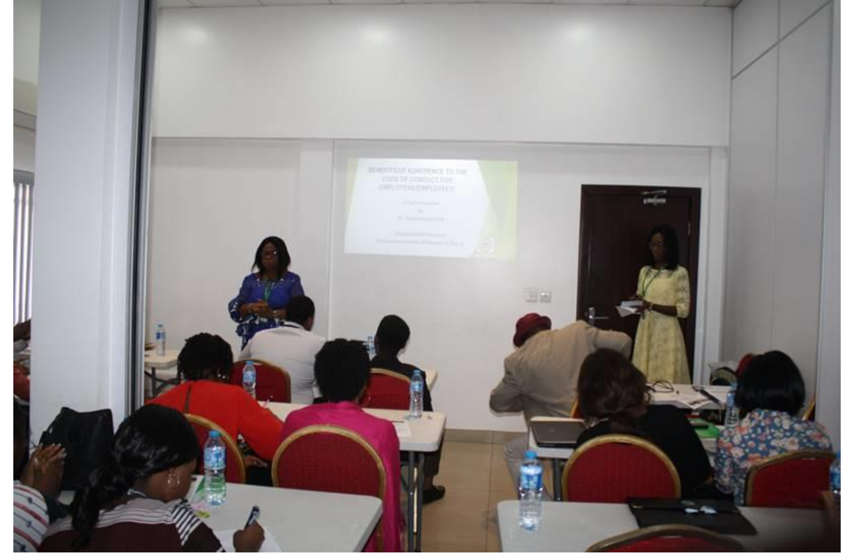
Cross- section of participants