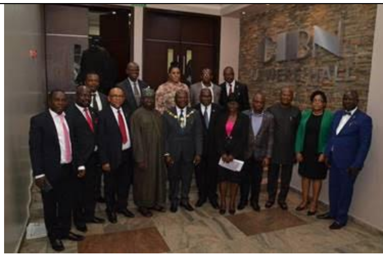
MEMBERSHIP DEVELOPMENT AND SERVICES COMMITTEE