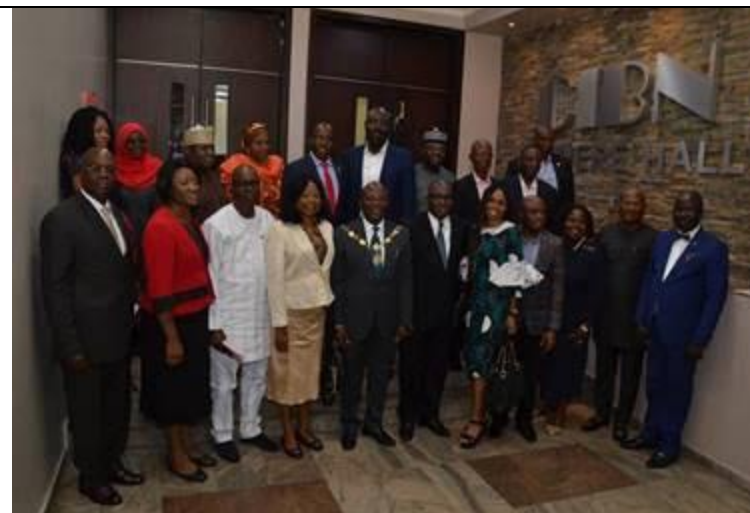
CAPACITY BUILDING AND CERTIFICATION COMMITTEE