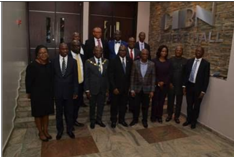
RESEARCH, STRATEGY AND ADVOCACY COMMITTEE