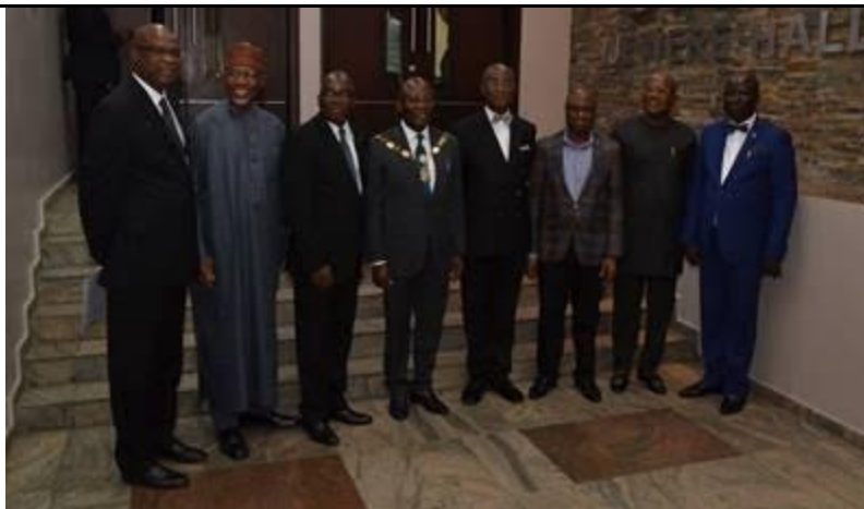
BOARD OF DIRECTORS OF THE CIBNCFs COMMITTEE