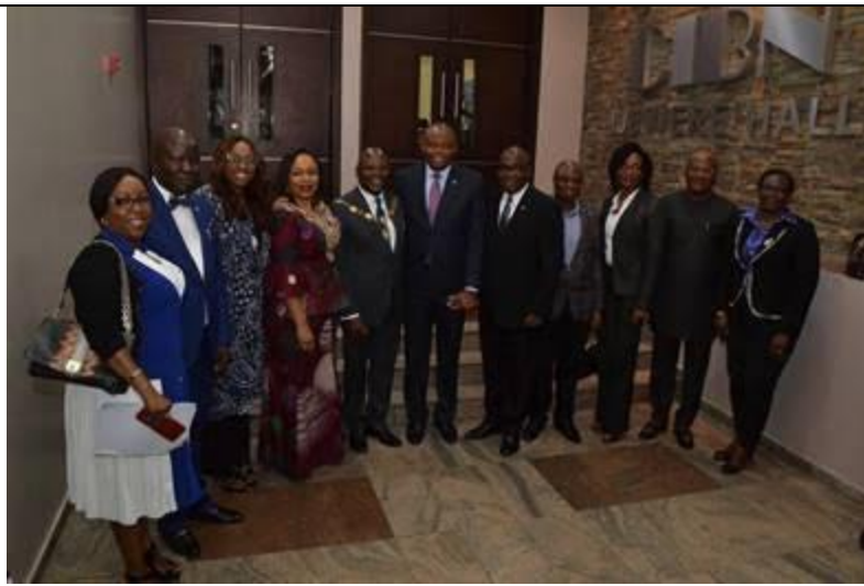
CIBN MENTORING ADVISORY COMMITTEE