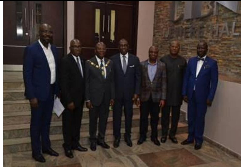
GRANTS AND FUNDS COMMITTEE