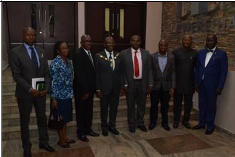
CIBN AUDIT COMMITTEE