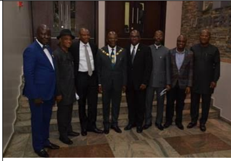
CIBN DISCIPLINARY TRIBUNAL COMMITTEE