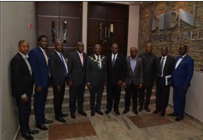
BOARD OF DIRECTORS OF THE CIBN PRESS COMMITTEE