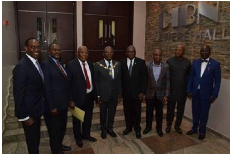
BUSINESS AND GOVERNMENT RELATIONS GROUP COMMITTEE