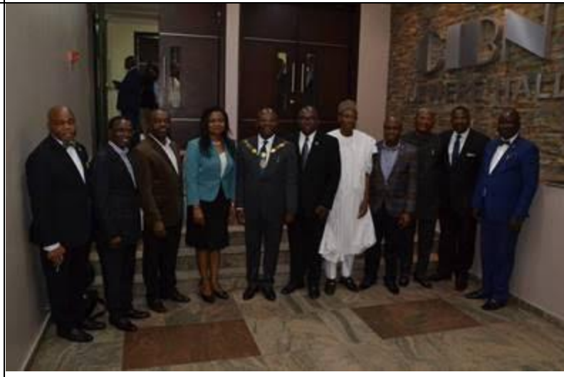
CIBN INVESTIGATING PANEL COMMITTEE