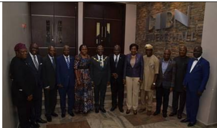
THE BOARD OF FELLOW AND PRACTICE LICENSE COMMITTEE