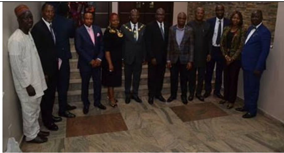
FINANCE AND GENERAL PURPOSES COMMITTEE