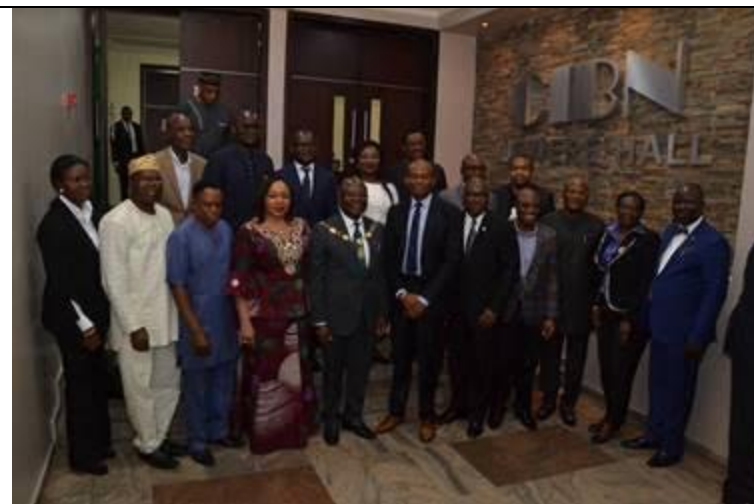
ANNUAL BANKERS DINNER COMMITTEE